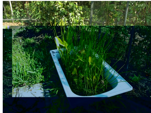
The water chestnut bath