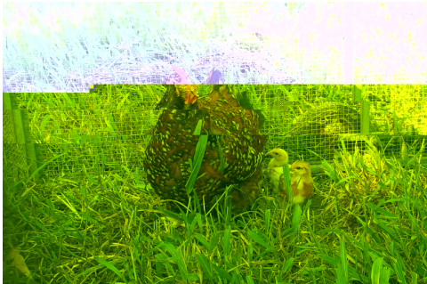
Hen and chickens in the "chook tractor"